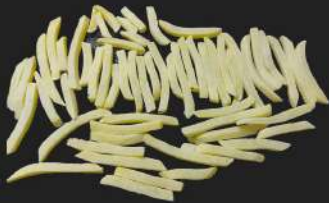
HALF FRIED POTATOES